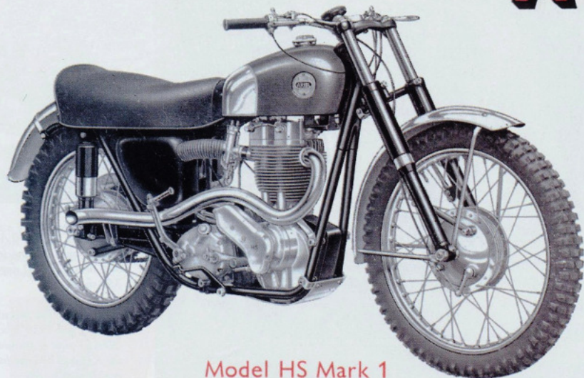
Model HS Mark 1